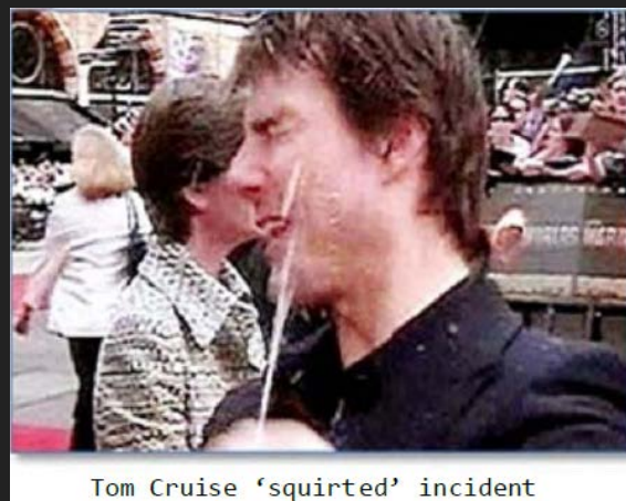
Tom Cruise 'squirting' incident

A look at relevant historical protection related events to provide and by protection operators, where protecting lifestyle and the prevention of embarrassment are more relevant than 'catching bullets' and looking under every rock for an improvised explosive device. Participants are expected to analyse the provided examples themselves, draw comparisons and identify key points from a variety of examples in addition to applying the knowledge and understanding gained from the training to identify mistakes or what could have been done better.