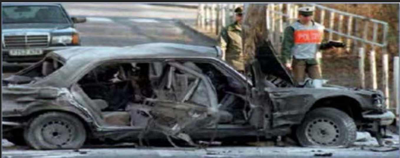
The Alfred Herrhausen Assassination